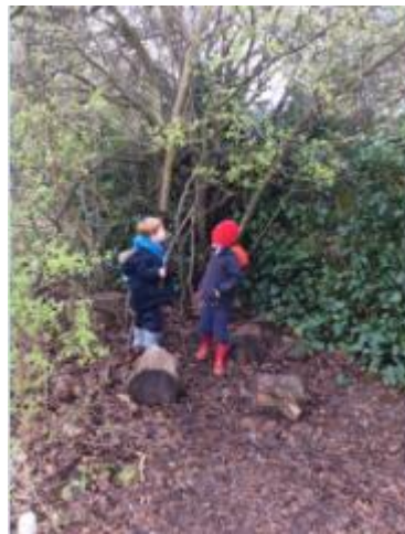
Reception children during a Nature Explorer's session.