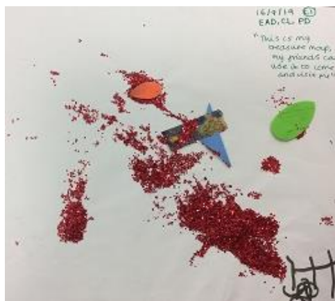
A Reception pupil's treasure map based on the outdoor learning area.